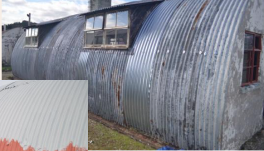
Example of self catering hut stripped back to zinc coating ready for re-painting