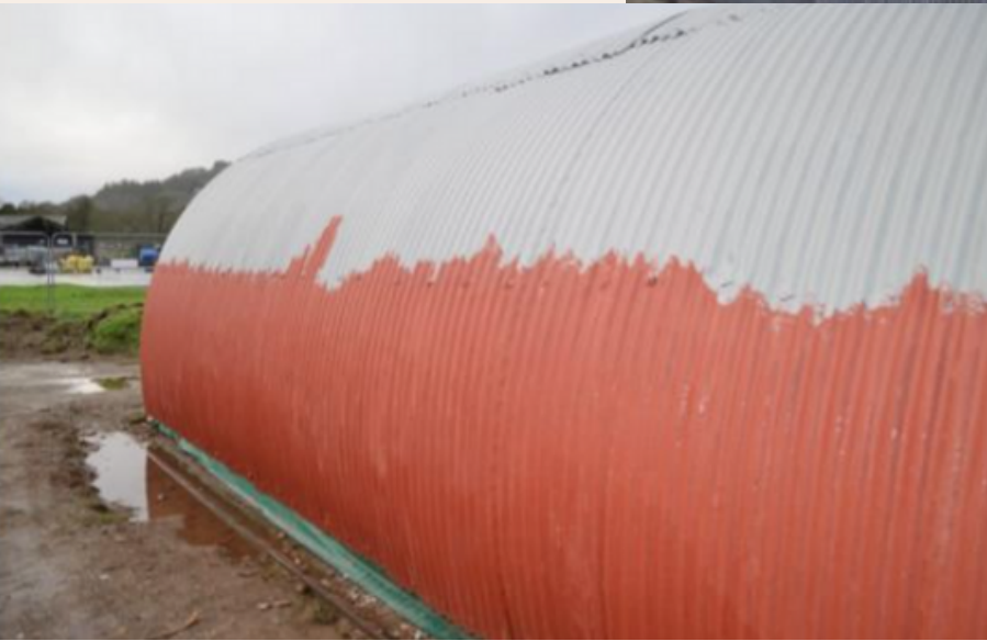
Example of self catering hut cladding showing application of priming coats