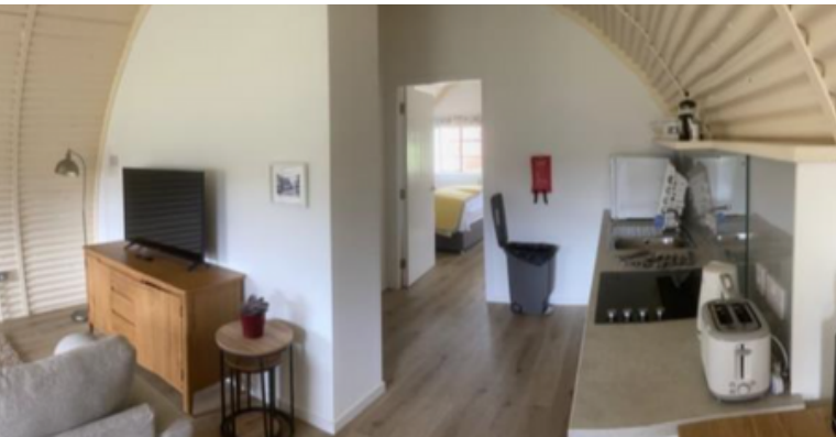
Example of kitchen installed in recently upgraded B listed hut

The new site will enable us to extend our reach and support even more young people and families in need in rural West Perthshire.