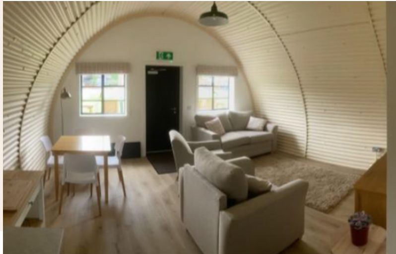
Example of upgraded interior to recently refurbished Grade B self-catering huts

We offer a wide range of physical activities, mental health support, volunteering opportunities and employment support. There is something for everyone and participants are involved in the choice and planning of activities throughout their Starfish Way journey.