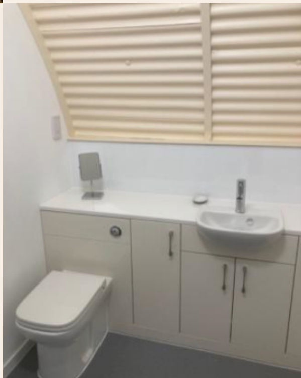
Example of bathroom installation in recently refurbished Grade B self-catering hut

We work in partnership with PKC Youth Services, Social Work and REACH Edge of Care teams, primary and high school ASN and high nurture departments, specialists' schools and many Perth & Kinross youth groups and family organisations including Perth Autism, Families Empowering Communities Letham and PKAVS Young Carers.