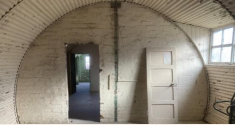
Example of existing interior to hut 47 showing zinc wall cladding and masonry dividing walls